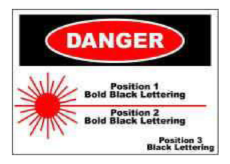
Figure 3: Sample warning sign for certain Class IIIa and for Class IIIb and Class IV lasers